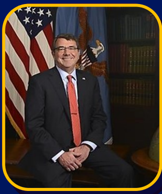
DoD CFC Chair The Honorable Ash Carter, Secretary of Defense