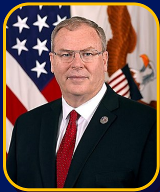
DoD CFC Vice Chair The Honorable Robert Work, Deputy Secretary of Defense