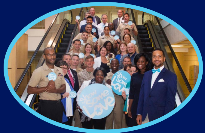
The Department of the Navy's 2016 Campaign Team

This year's theme encourages Federal employees to Show Some Love to the causes that mean the most to them. With more than 20,000 participating charities, the campaign gives donors the option to support their favorite charities.